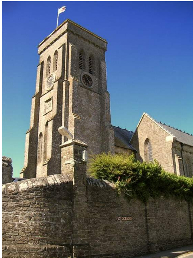
Holy Trinity, Salcombe